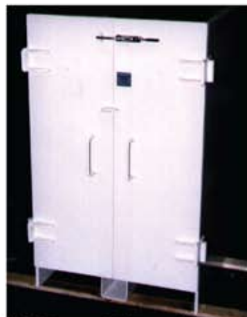
Shown above: A custom designed Shielded Source Cabinet featuring seven drawers and locking doors.

You've Got a Problem... We've Got a Solution!